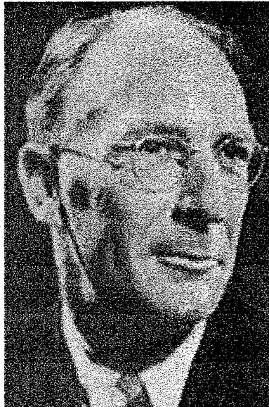
C S Forester

It took a while. One never knows how much appeal anything has until it is tried.