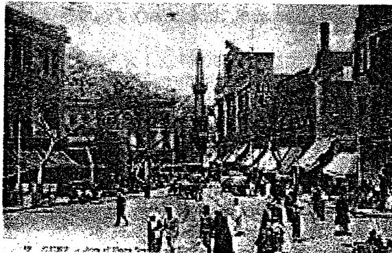
Cairo in the 1900s