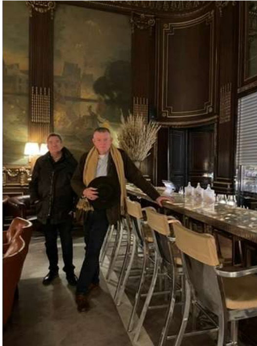
The Bar at the Meurice; looks alright.