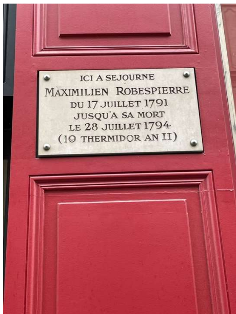
History all over the place, this we saw on our way to the Meurice.