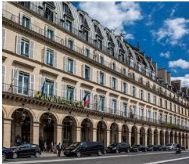
The Hotel Meurice in Rue Rivoli (the original in Hornblower's time was in Rue Saint Honoré just around the corner), where Hornblower received the parchment with his ennoblement to Lord Hornblower. Here we plan to have our welcome drinks Friday 18 October at 18:00 hours.